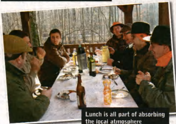
Lunch is all part of absorbing the local atmosphere