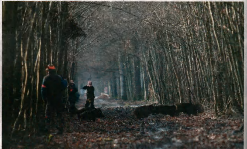
Safety is paramount and in my opinion this shot is far too close for comfort