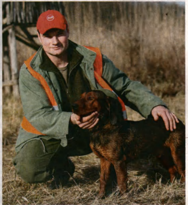
You will be amazed at how brave the dogs are - just be careful you don't shoot one in error - with the red mist up, brown pigs and brown dogs can be confused