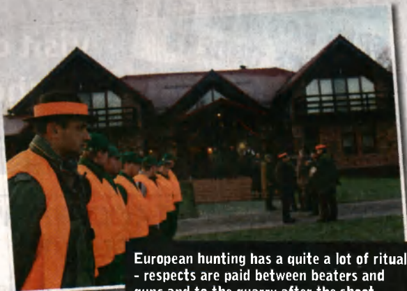
European hunting has a quite a lot of ritual - respects are paid between beaters and guns and to the quarry after the shoot.