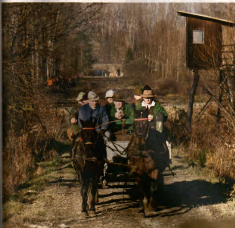
Most transport is motorised but horse-drawn shoot wagons have a special charm